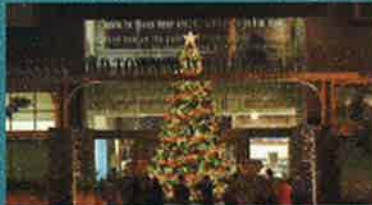
Newhall Library Christmas Tree