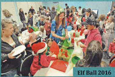
Elf Ball 2016