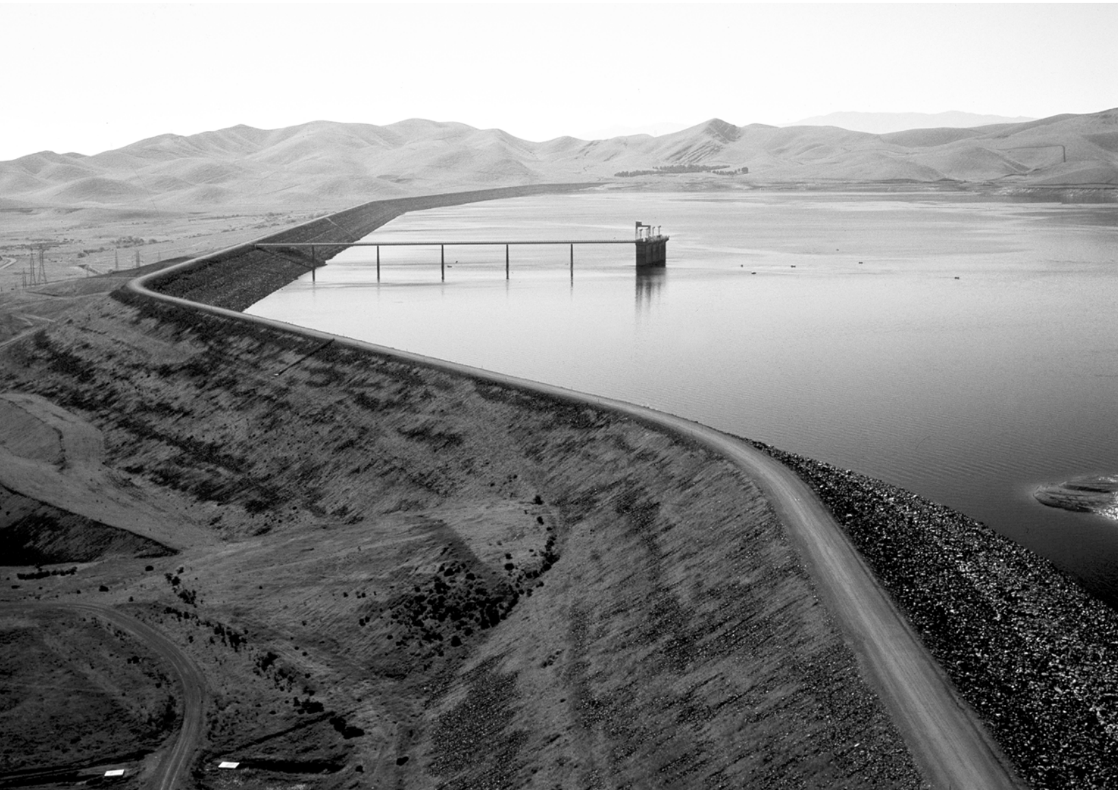
San Luis Reservoir